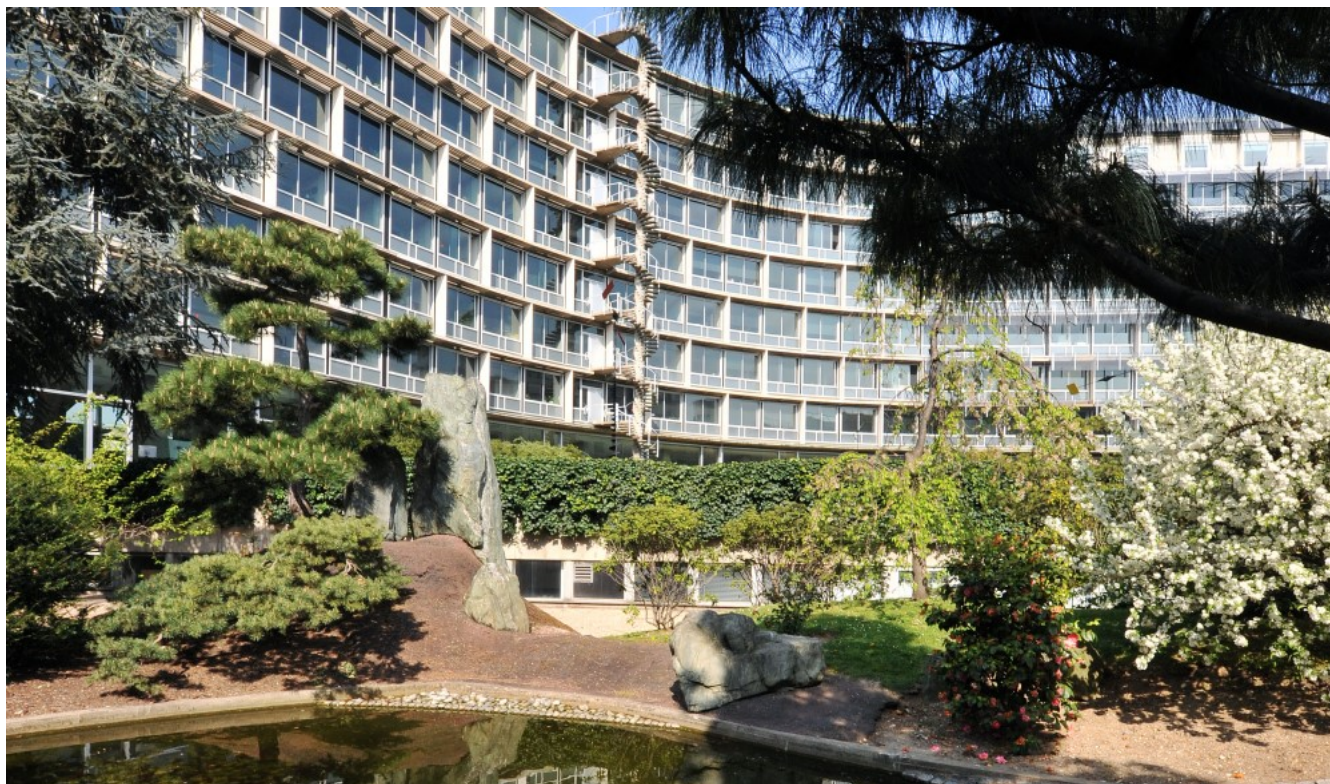
Image: UNESCO Headquarters in Paris - The Garden of Peace (or Japanese Garden) in Spring, by UNESCO, is licenced under CC BY-SA 3.0 IGO. ( https://creativecommons.org/licenses/by-sa/3.0/igo/deed.en )

Express interest ( https://forms.gle/rJR5vHWAqkNsvnBo9 )